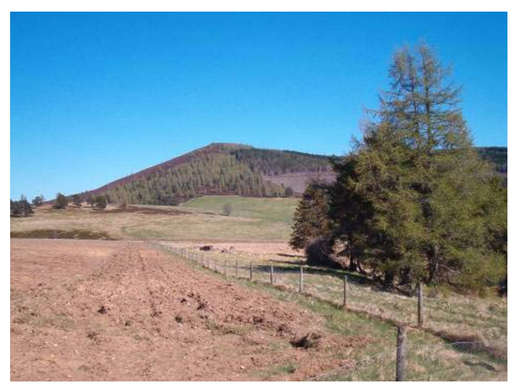
Fig 3 View of site (between ruin and trees) looking towards public road