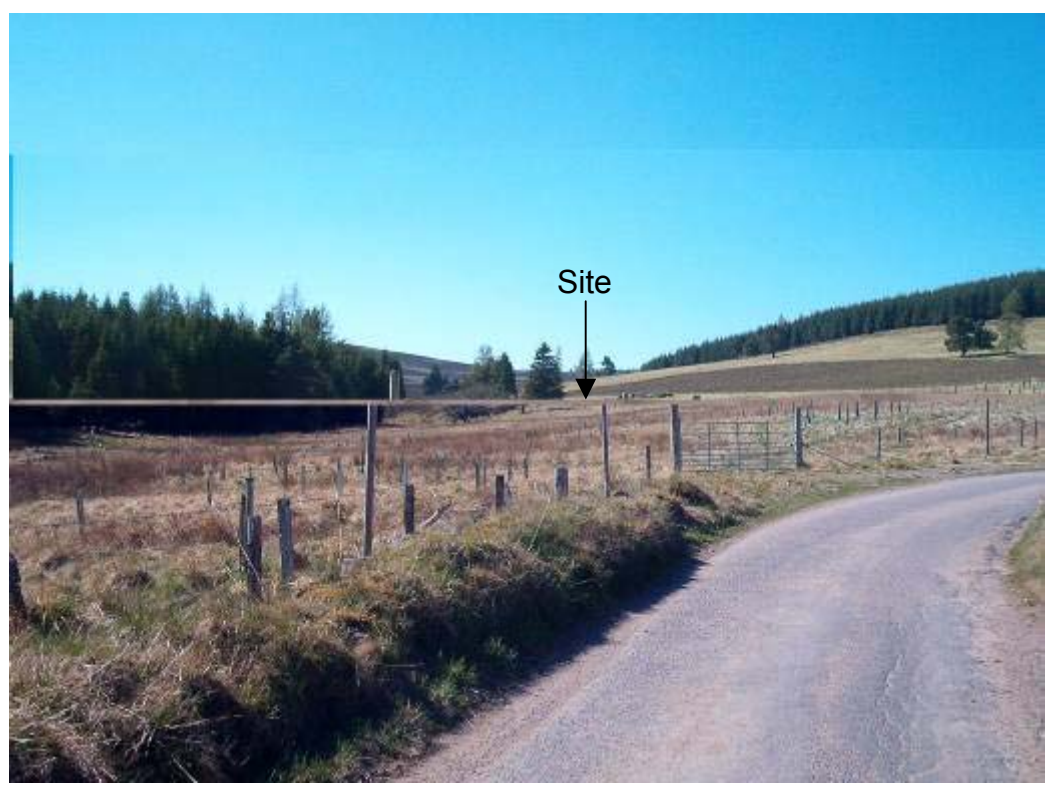
Fig 2 View towards site showing access through gate from public road

frame and timber cladding. Larch will be used which negates the requirement for paintwork and will fade naturally. The additional information also points out the potential for ground source/air source heat pumps is being investigated as part of the proposal. The building will also have high insulation values. The site has been chosen by the applicant to balance a number of characteristics including a feeling of remoteness with good views to be enjoyed by clients while still being near the road. The idea was also to keep the building low down as opposed to on a hillside and the newly planted trees will provide screening from the road. In addition, clients will be on the doorstep for their stalking venue.